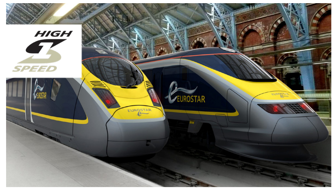
High Speed 1 operates the high speed railway linking London with the Channel Tunnel. It also operates the stations along the route: St Pancras International, Stratford International, Ebbsfleet International and Ashford International.

Our portfolio companies have seen encouraging progress to date, setting ambitious net zero targets underpinned by robust decarbonisation strategies